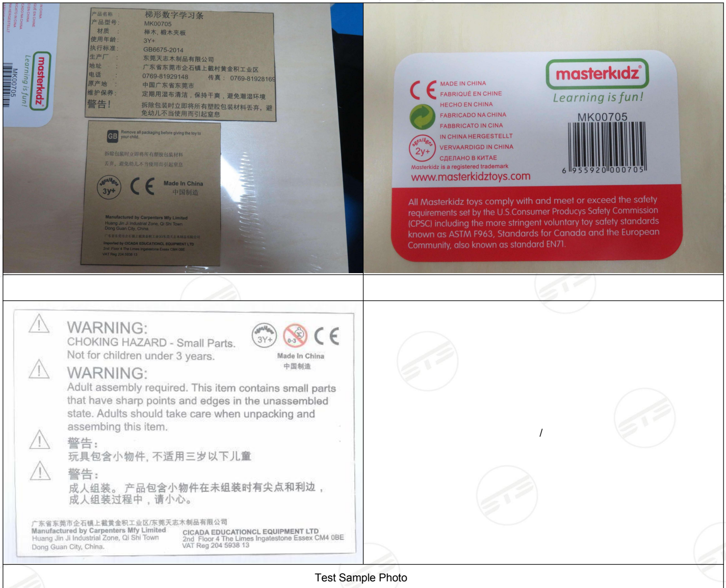
Test Sample Photo